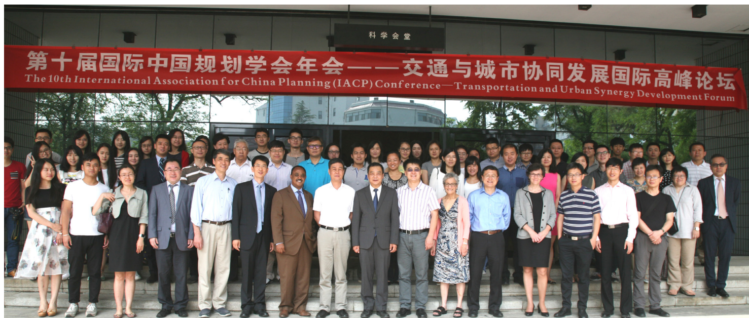
Group Picture of Conference Participants 参会者集体合影

刘军首先对本次年会的召开表示祝贺，对出席本次活动的嘉宾和各位专家学者表示欢迎。他指出，此次建筑与艺术学院承办的“第十届中国规划学会(IACP)年会——交通与城市协同发展国际高峰论坛”，体现了“交通”二字在《易经》中“天地交而万物通”的融合、协同精神，以举办此次高峰论坛为契机，将交大重点学科交通与新兴学科城市规划有机结合。此次论坛通过借鉴国际经验，结合中国实际问