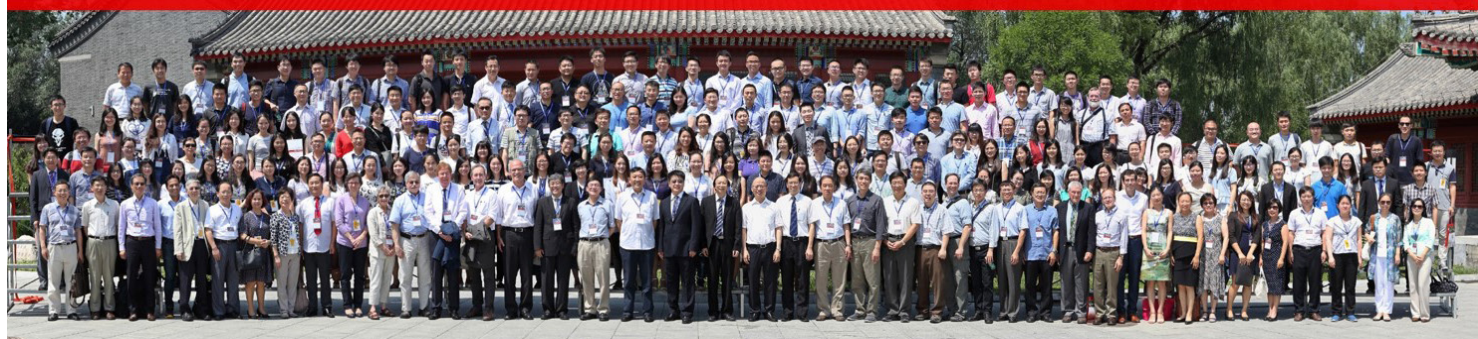
Group Picture of Conference Participants 参会者集体合影

"Governance and Planning in Transitional China" The 10th International Association for China Planning (IACP) Conference