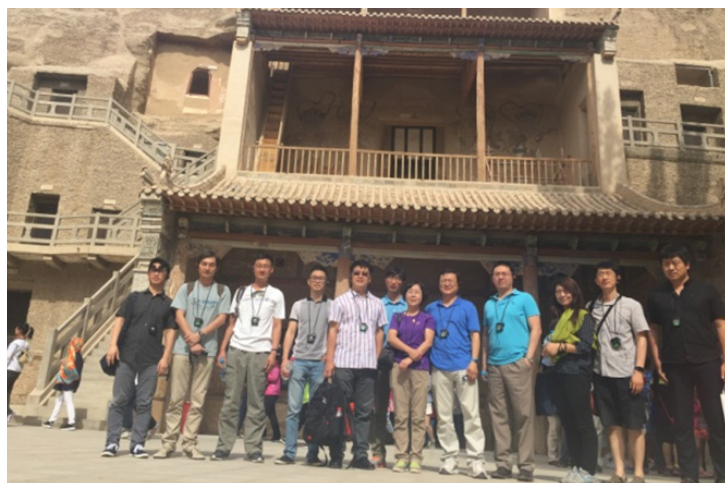
IACP Delegation Visiting Dunhuang