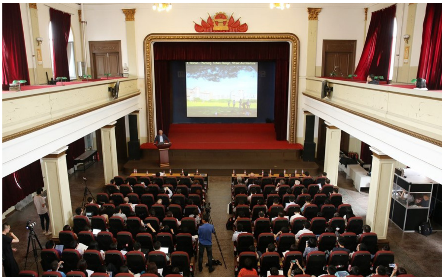
IACP Conference Venue 国际中国规划学会年会会场

本次会议主题为“空间响应——回归人本的城市规划与设计”。会上，专家学者就“一带一路”战略与区域发展，老工业基地振兴，城乡统筹与乡村建设，城市政策、管理与经济，城