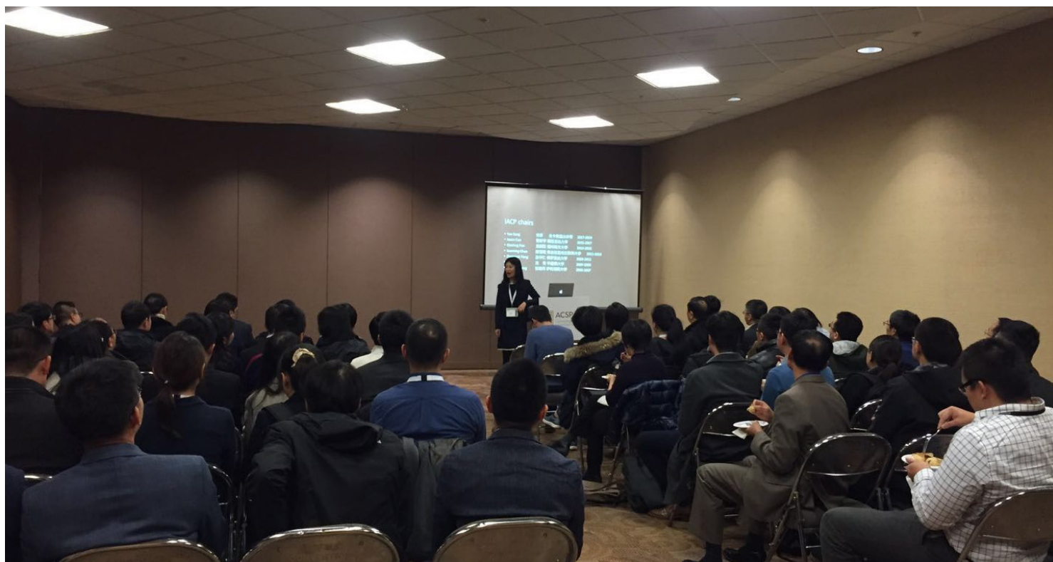
IACP business meeting at ACSP / IACP在ACSP的商务会议