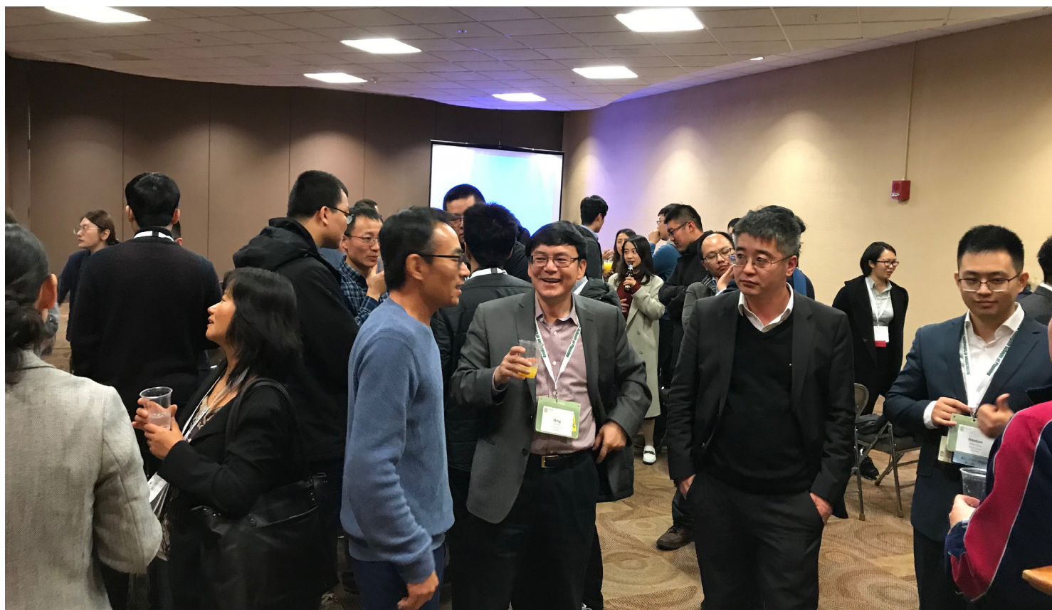
IACP Reception / IACP 招待会