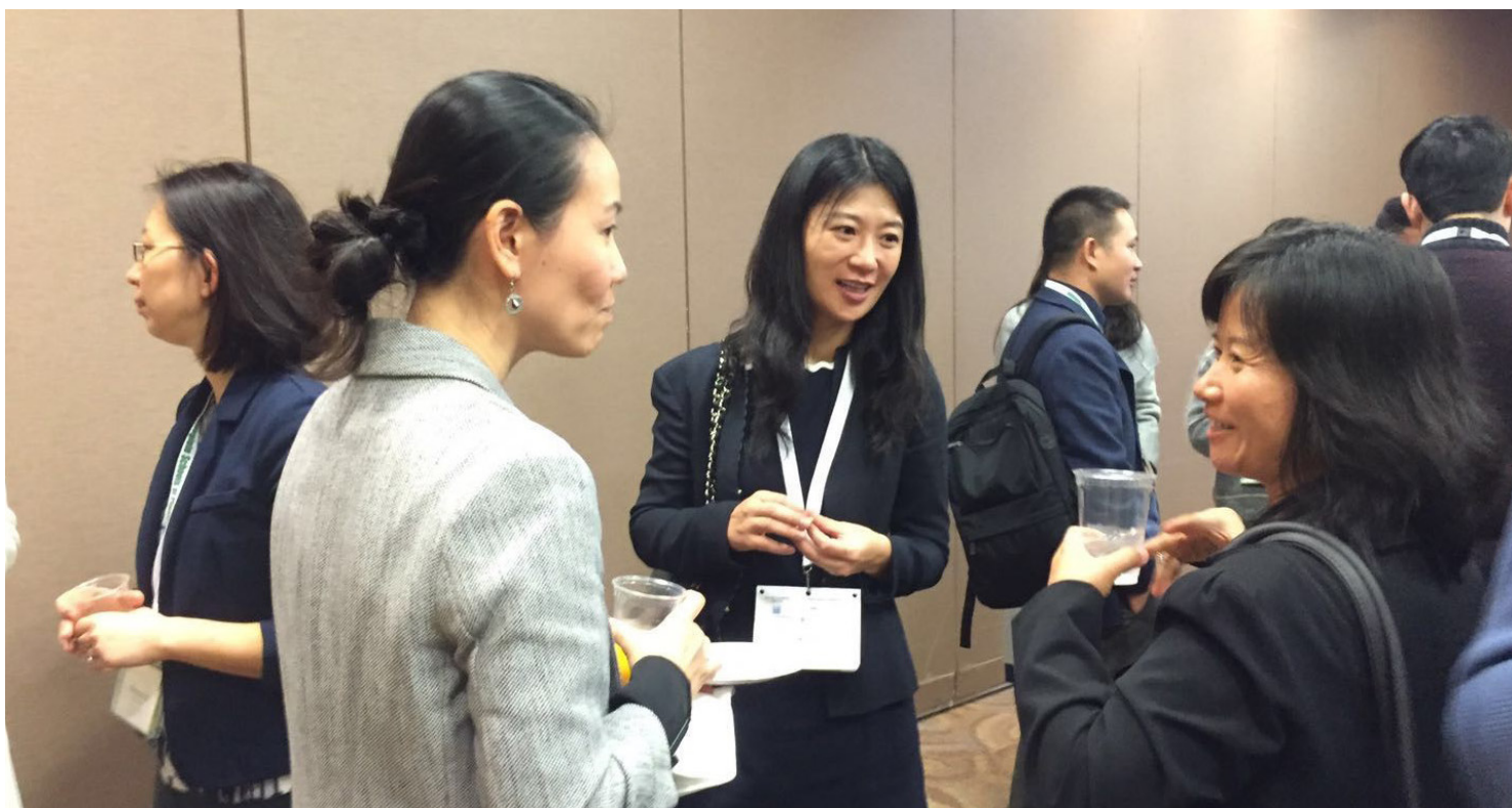
IACP Reception / IACP 招待会