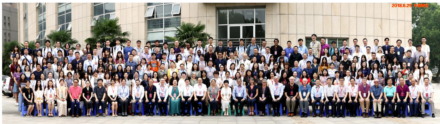
IACP Conference Venue 国际中国规划学会年会会场