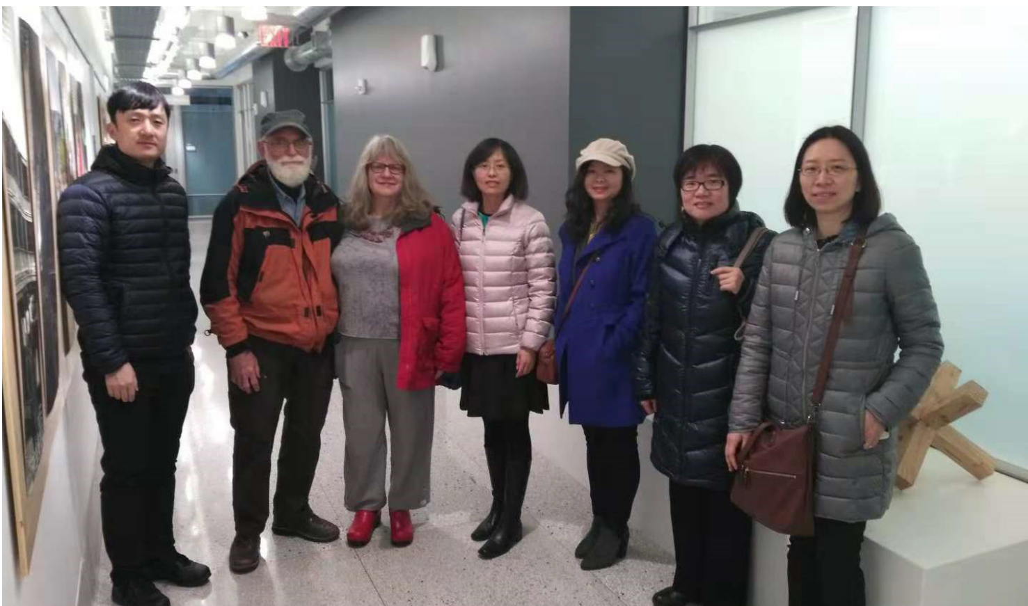
Visiting UB / 参观纽约州立大学布法罗分校