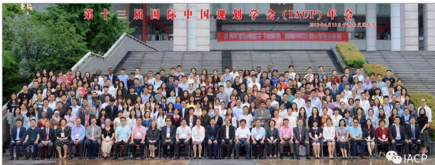
IACP Conference Venue 国际中国规划学会年会会场

本次会议邀请到了世界知名专家为大会作主旨演讲。中国工程院院士同济大学吴志强教授；华南理工大学孙一民教授；马萨诸塞大学Piper Gaubatz教授；华南理工大学肖大威教授；和伦