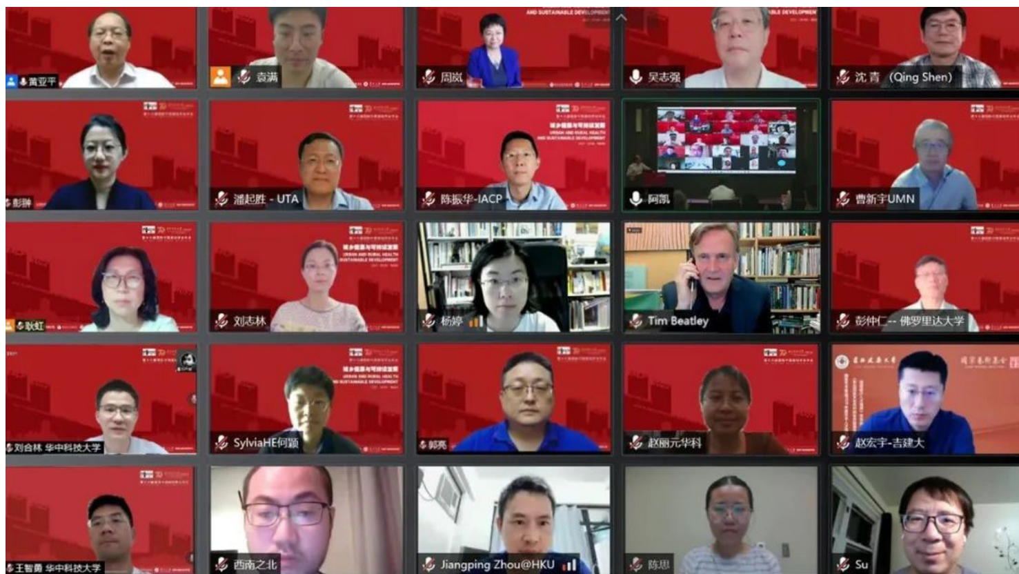
IACP Conference Venue 国际中国规划学会年会会场

2022年6月23日，第十六届国际中国规划学会年会通过线上线下结合形式正式开幕，会议主题为“城乡健康与可持续发展”。本次国际会议由国际中国规划学会、华中科技大学主办，华中科技大学建筑与城市规划学院承办，湖北省国土空间规划学会、自然资源部城市仿真重点实验室、湖北省城镇化工程技术研究中心、武汉市规划研究院、贵州大学建筑与城市规划学院协办。会议聚焦中国规划教育发展、存量更新的城市规划应对、生态城市建设等领域。开幕式由华中科技大学建筑与城市规划学院院长黄亚平教授主持，华中科技大学党委委员、副校长梁茜教授与国际中国城市规划学会（IACP）主席董宏伟教授莅临大会并致欢迎